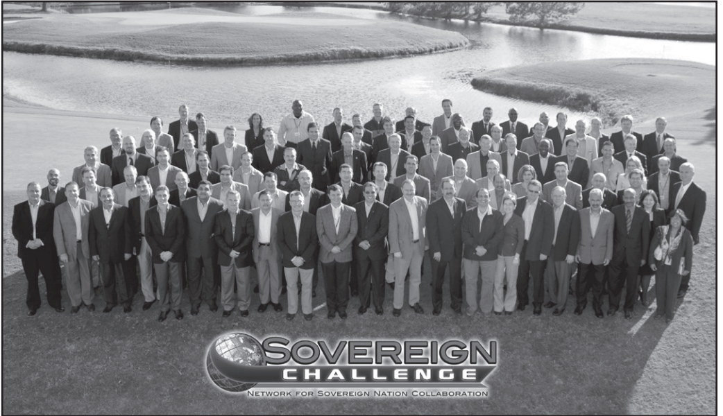
Conference participants, Destin, Florida