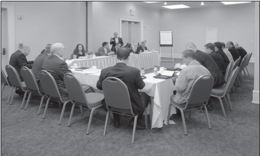
Breakout Group Session

The moderators from all six groups reported candid and enthusiastic exchanges that reflected the perspectives of the individual countries while seeking to understand both the complexities and consequences of the individual issues. The following is a summary of the breakout group discussions and report.