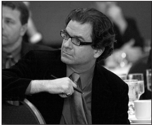
Mr. Peter Bergen

However, Mr. Bergen argues, Al Qaeda does have significant influence on events in Afghanistan and Pakistan and a continued capacity to carry out attacks against the West, particularly in Europe and other centers of western influence (e.g. businesses, hotels, and citizens around the world). He noted that Al Qaeda is “nearly dead in Iraq” because of a “suicide assisted by SOCOM.”